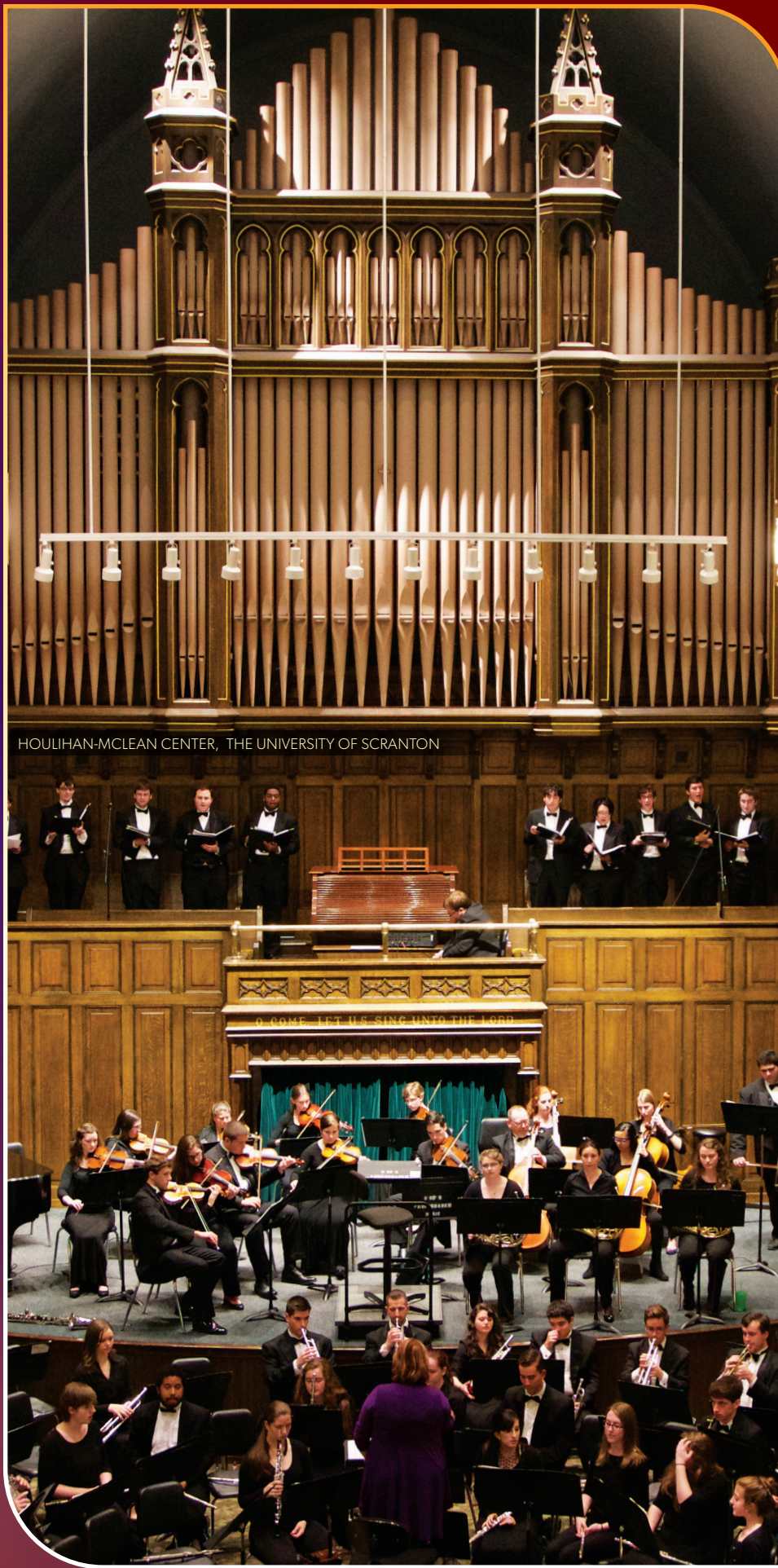
HOULIHAN-MCLEAN CENTER, THE UNIVERSITY OF SCRANTON