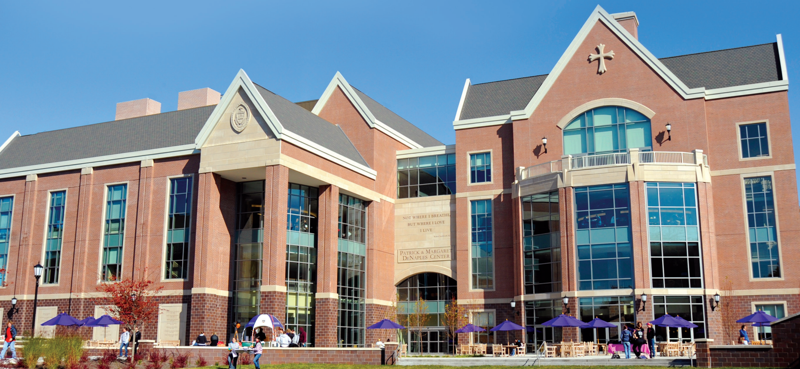
The DeNaples Center at The University of Scranton

Located in the middle of Downtown Scranton, the University of Scranton is surrounded by great cultural landmarks, eateries, and attractions. The Scranton City Guide, produced by the Office of Global Education, is a great resource for finding a place to live, and for information regarding some of the many things Scranton has to offer.