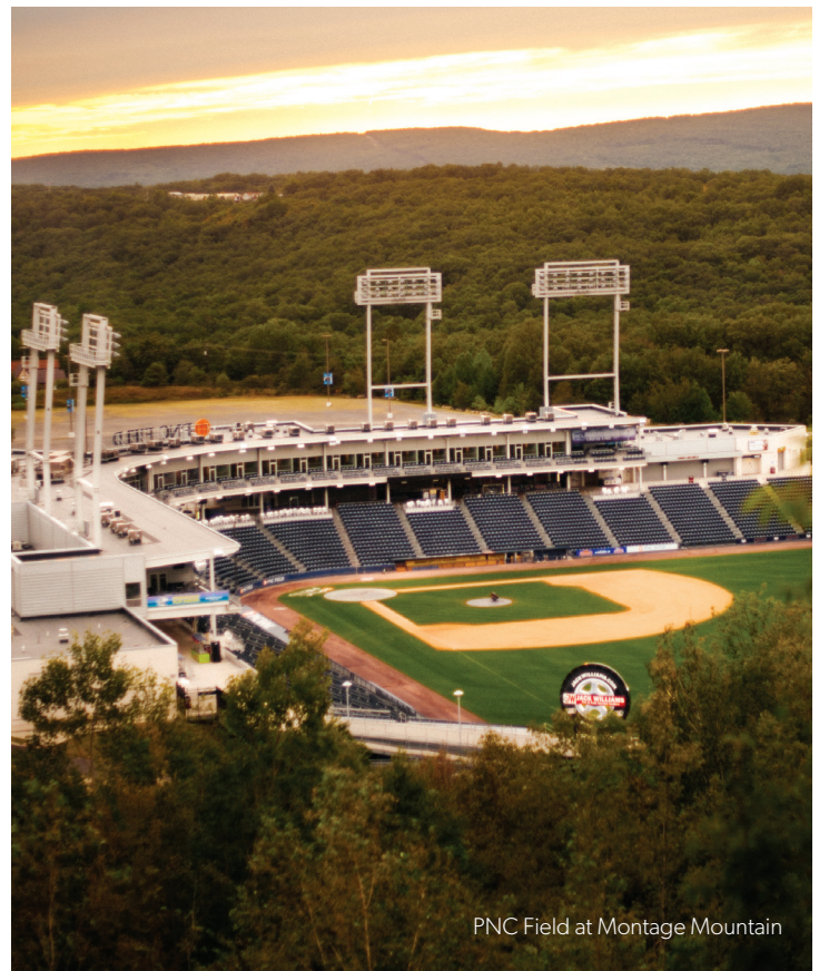
PNC Field at Montage Mountain

425 N Washington Avenue Scranton, PA 18503 570.348.3400 scrsd.org