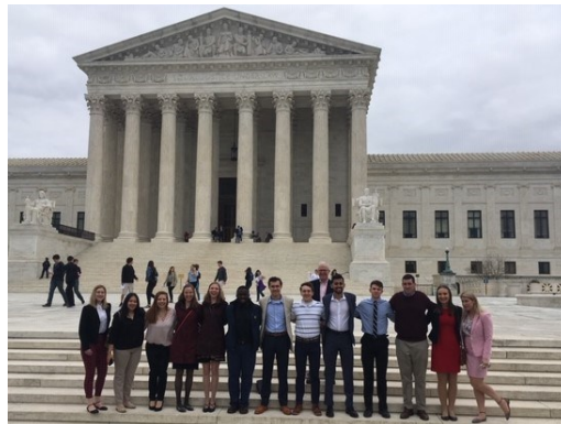
Students took the opportunity to tour the Supreme Court of the United States. Future Solicitors General?